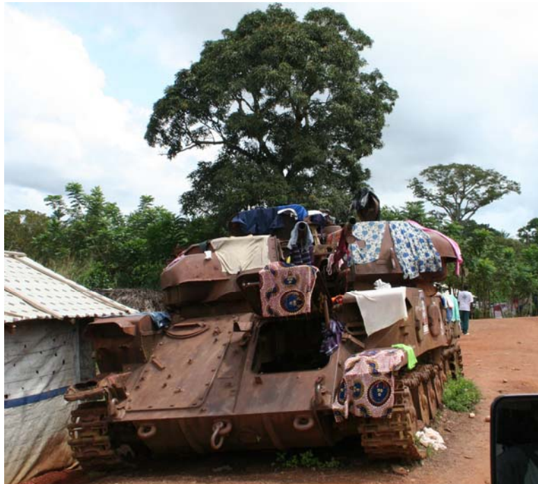
A discarded military tank in Sierra Leone being used for dry washing. During the civil war of 1991–2002, the country was under a UN arms embargo during the war which arms brokers routinely broke.

While the high profile trial of Viktor Bout in New York will show some of the threats the world continues to face from unscrupulous private arms brokers, it only provides a glimpse into a much larger problem. Skilled at operating in the shadows and exploiting weak national arms transfer controls, arms brokers have funneled arms to almost every country under a UN arms embargoes in the last 15 years, often fueling armed conflict and serious human rights violations.