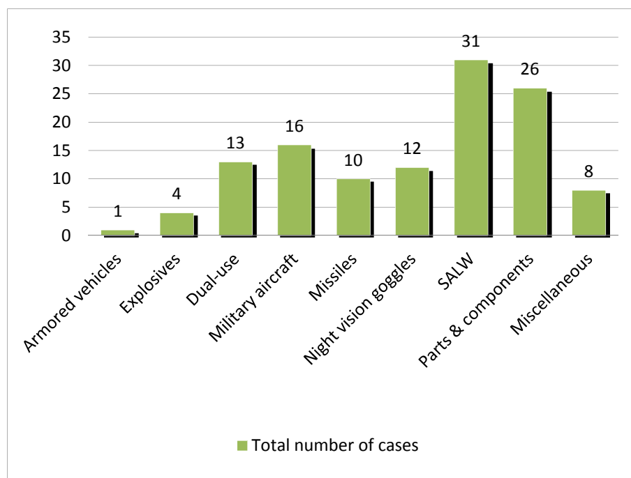
Figure 2: Number of arms and dual-use items in US prosecutions related to arms brokering by type, January 2007 to June 2011

In 31 of the 70 US prosecutions, arms brokers allegedly chose or did choose to illegally transfer SALW or related ammunition and components, making it the most popular type of arms involved in such US prosecutions (see Figure 2). On September 10, 2010, for example, Immigration Customs and Enforcement (ICE) arrested Nguessan Yao, an Ivorian citizen, on suspicion of conspiracy to export “4,000 handguns, 200,000 rounds of ammunition, and 50,000 tear gas grenades” from the US to Côte d’Ivoire, which is under a UN arms embargo. 45 At the time, Côte d’Ivoire was in a delicate ceasefire between opposition groups; such a transfer could have been enough to encourage one of the fighting forces to break the agreement. Parts and components for all types of arms, but particularly for military jet and helicopter aircraft, ranked second in such US prosecutions. In a total of four of the 26 cases associated with parts and components or dual-use items, the defendants allegedly or actually aimed to export components related to the creation of weapons of mass destruction. In one such example, on October 20, 2010, the US Department of Justice sentenced Juwhan Yun to 57 months in prison for illegally brokering components for a number of items, including a propulsion system for long-range missiles on the Missile Technology Control Regime control list to South Korea. 46 Yun had previously been convicted in US courts for an attempt to export Sarin gas. 47