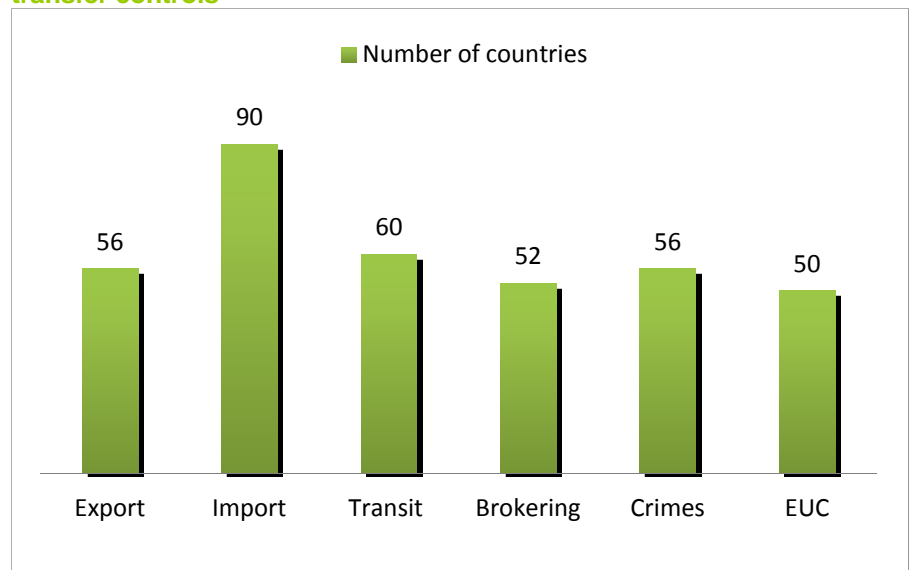
Figure 3: Number of countries reporting key types of international arms transfer controls

As evidence in the example at the end of the preceding section regarding Slobodan Tescic, foreign countries can sometimes identify whether a particular arms transfer has the potential to be diverted to an unintended end-user by evaluating the specifics of the transfer. In the case in which Albanian arms went to Libya, the transfer of such a large quantity of mortars to a rather small population should have raised some suspicion among Albanian government officials, as well as the fact that Tescic was involved in the deal. An estimated 150 countries, however, did not officially make such a risk assessment, as of 2006. 77